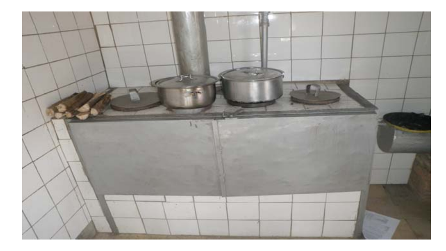
Figure 1: TEKUTANGIJE cooking stove

consumption, and their kitchen is cleaner than before.