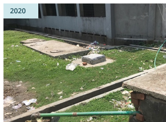
Figure 4: Upgrades to the water system following sensitisation of the health stakeholders at Kurigram District Hospital.

The utility of E. coli in characterising hazards in healthcare facility water systems: Evidence from Bangladesh. Ong, L., Mahmud, Z.H., Alam, M., Ferdous, J. and Charles, K. Water Safety Conference 2022 in Narvik, Norway.