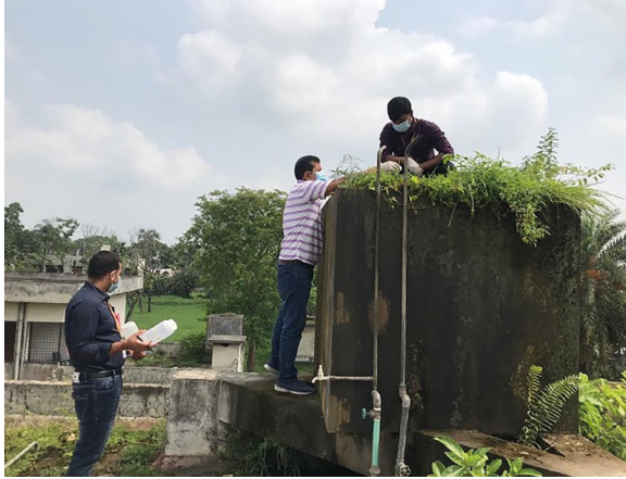
Figure 1: Hospital water systems had multiple risks to water quality from poor management of solid waste, poor source protection, and lack of maintenance systems, and poor hygiene around sinks and non-clinical areas.